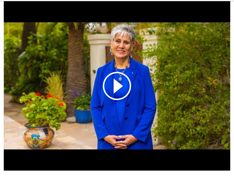
Integrity's wide-ranging resources and best-in-class technology will empower Sellyei & Rundle to achieve even higher levels of service and support.